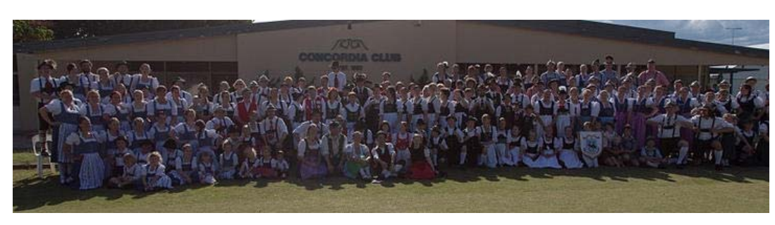
2013 Brücke Volkstanzfest Group Photo, Concordia Club, Sydney NSW